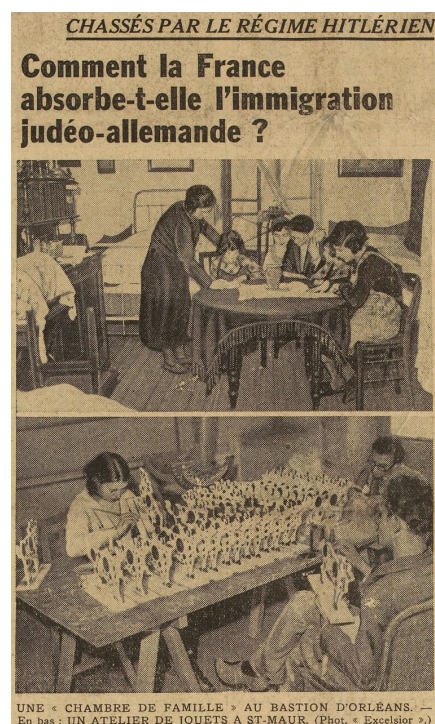
Fig. 1: “Comment la France absorbe-t-elle l’immigration judéo-allemande?” (“How is France absorbing German-Jewish immigration?”), in: Excelsior , 22 January 1934, 1; Bibliothèque Nationale de France .

In 1935, the French government tightened its policy even further, henceforth tolerating only foreigners holding a work permit. In 1934 and 1935, 40,000 to 50,000 Jewish refugees were forced to leave France: the number of departures exceeded the number of arrivals. In the absence of a global solution, the left Front Populaire , which came to power in 1936, decided on a provisional solution by creating a ‘certificate of identity for refugees from Germany’, which conferred refugee status on emigrants who had arrived in France between 30 January 1933 and 5 August 1936.