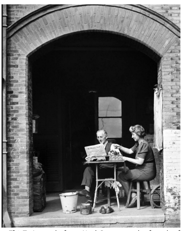
Fig. 7 : A couple from Nazi Germany who found refuge in Shanghai, 1946. Refugee families carefully read the German language edition of The Shanghai Herald with news of proposals for repatriation.

Relief and Rehabilitation Administration (UNRRA) and the International Refugee Organization (IRO), 3,141 German and Austrian displaced persons returned to Europe. More refugees conveyed interest in the Zionist project in Mandatory Palestine and departed for the State of Israel after 1948. The IRO reported that 5,112 Shanghai refugees resettled in Israel, though that figure may include some Russian Jews who fled to China before the Second World War. Ultimately, most of the German-speaking Jews in Shanghai hoped to wait on a quota visa for the United States or entrance to Australia.