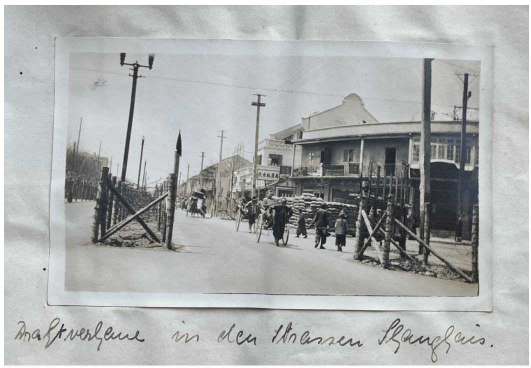
Fig. 1 : Barbed wire barricades and sandbags in Shanghai, around 1937. Photo by Suse Schauss, entitled Drahtverhaue in den Strassen Shanghais . ( Barbed wires in the streets of Shanghai .); courtesy of Sonja Mühlberger.

Initially, neither the Japanese authorities nor the Shanghai Municipal Council put qualifications on entry. As the number of refugees arriving with each passenger ship rose, and fears of strained resources increased, a groundswell of support for limiting or ending the refugee stream developed. Compelled by the coercion of the Nazi regime, Jewish refugees departed Europe, usually traveling by train through Fascist Italy to reach ports of departure. In Shanghai, Japan continued to hold a part of the International settlement known as Hongkou, where new arrivals were most likely to find housing. All three Axis powers did not attempt to stop the exodus of refugees to Shanghai, and indeed often facilitated it.