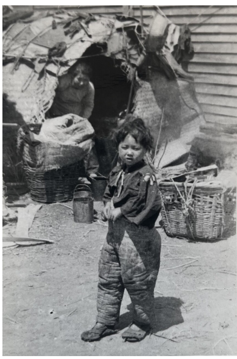
Fig. 5 : Chinese refugees in the Hongkou district of Japanese-occupied Shanghai, around 1940. Many suffered from severe poverty, as shown in the photo by Genia Nobel; courtesy of Sonja Mühlberger.

After a year of uncertainty, on 18 February 1943, the Commanders of the Japanese army and navy in Shanghai released a proclamation that stateless refugees who had entered the city after 1937 would be required to relocate to a 'designated area' in Hongkou. The area consisted of a little under one square mile, in an area that housed several thousand European refugees already, as well as close to 100,000 Chinese. Refugees quickly termed the designated area the 'Shanghai ghetto,' though Japanese officials were careful to avoid the terms 'Jews' or 'ghetto' in their announcement.